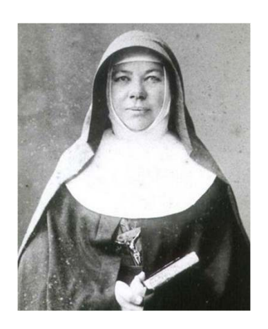
"Never see a need without trying to do something about it"

The Newsletters will be uploaded to our website this year. Use the link above.