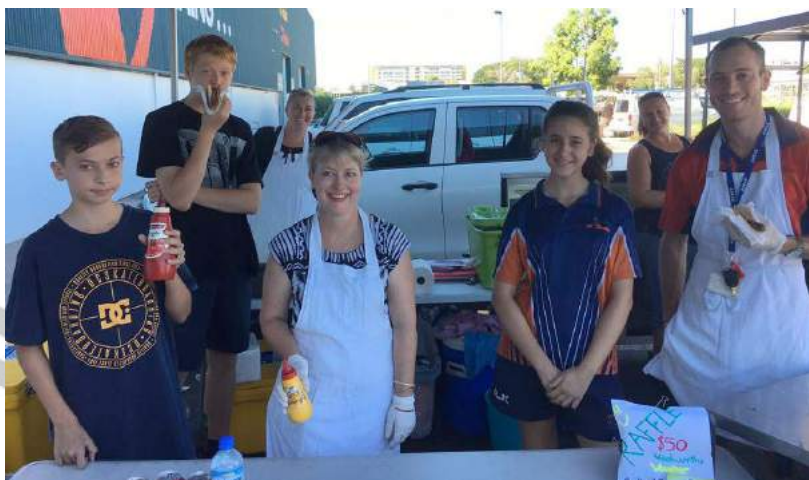
Bunnings BBQ Raising Money for the Japan Study Tour

For more information, contact us on 08 8930 5757 or email mackillopcollege@nt.catholic.edu.au