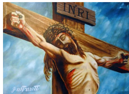
Image: Jesus nailed to the cross with INRI marked above his head.

been placed in the position and they were tugging Jesus to where he was going to die. Jesus was shaking with fear. The guards picked up the nail and hammer which was about to be jammed into Jesus' hand. The guard counted to three and bang the nail went in. Jesus screamed wanting to get off the cross and go to a safer place where he could live a normal life. Blood immediately started pouring from his hand. The other side and again bang the other nail was hammered into his other hand. With only two nails holding Jesus our beloved Leader by two thick nails they banged the third in the middle of his two feet that walked the paths we are walking on.