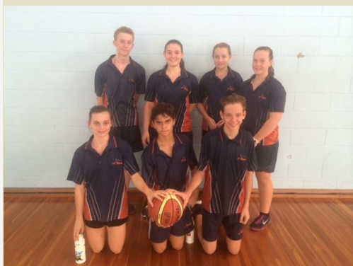
The MacKillop Catholic College victorious Basketball Team!