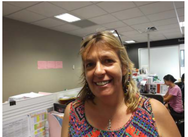
Bev Garside Art