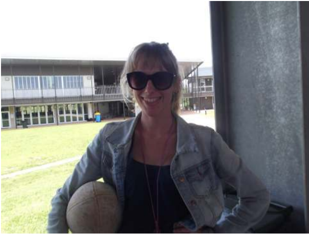
Natalie Hafsteins Performing Arts