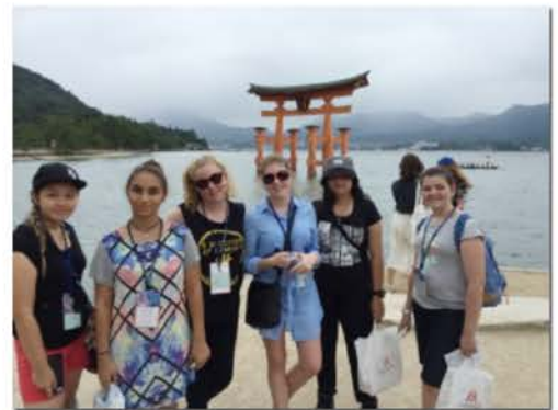
Students of Study Tour 2015