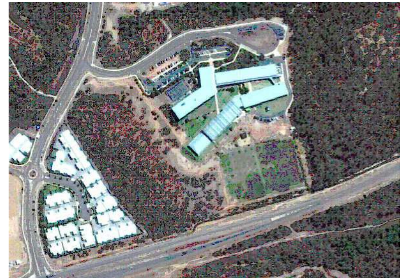
SITE PHOTO - 5 SEPTEMBER 2016 - NOT TO SCALE